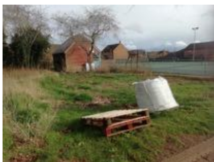
From this ...

The former play area near the tennis courts is being turned into two mini tennis courts to introduce children to tennis. A water supply to the tennis pavilion will be laid at the same time. Timeframe: 2024.