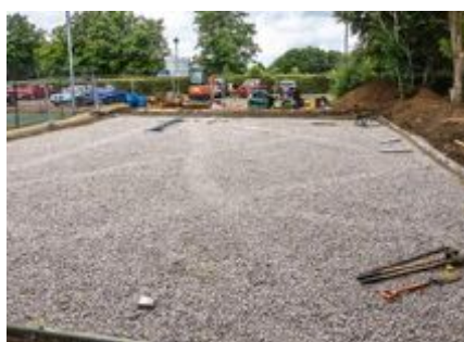
... to this (June 2024, completion July)